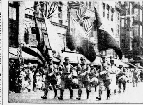
Color Guard of Y-D Post marching in the Moose parade.